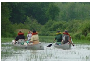
Canoeing on the St. Croix River.

Polk County has many tangible or hard assets to offer prospective businesses and industries. Another of the county's strengths are the intangibles or soft assets available.