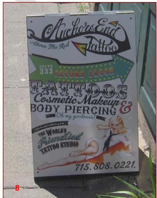
Creative design, business logo and colors, unique font.