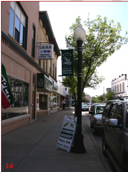
Plastic sign, no historic/architectural value, attached to a permanent structure.