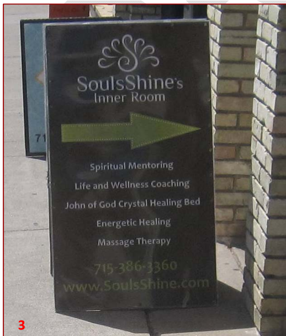
Painted wood sign, business-related colors.