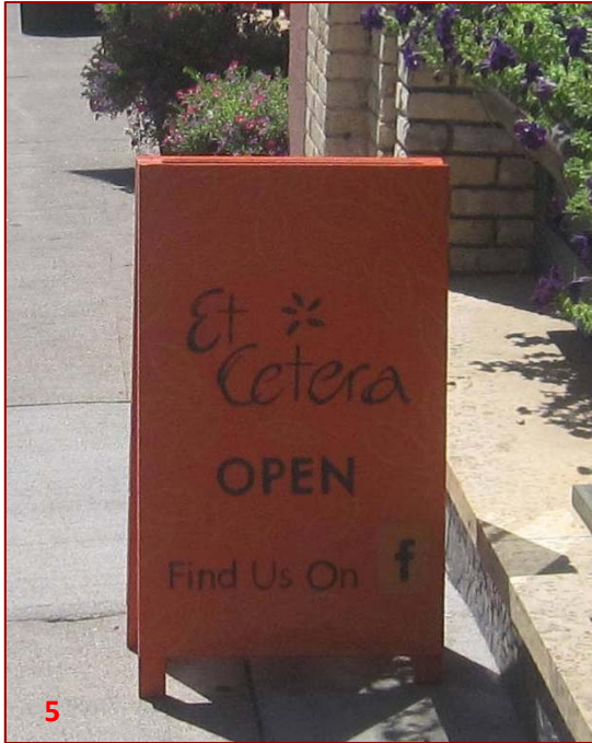
Painted wood sign, business logo, business-related colors.