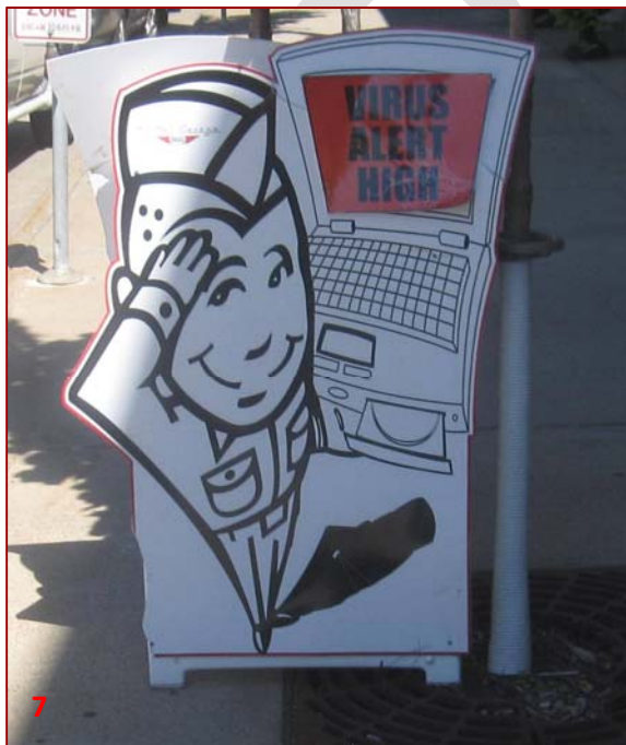
Creative design, business-related.