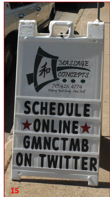
Plastic sign, no historic/architectural value.