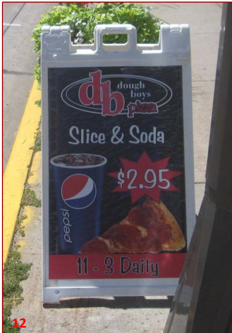
Plastic signs, no historic/architectural value.