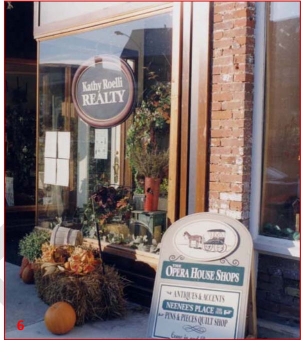
Painted wood sign, business logo, historic/business-related colors. Courtesy of Wisconsin Main Street Program