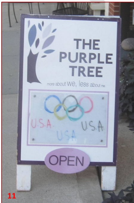
Wood sign, business logo and colors, handwritten/business-related content.