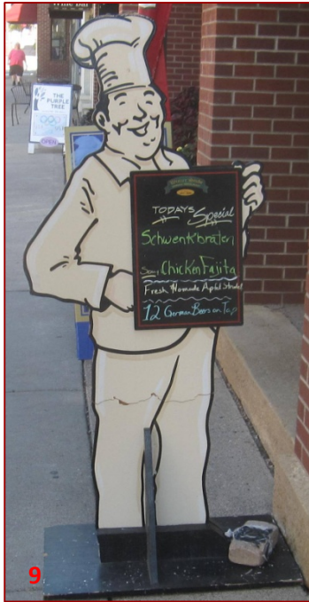
Wood sign, unique design, handwritten/business-related content.