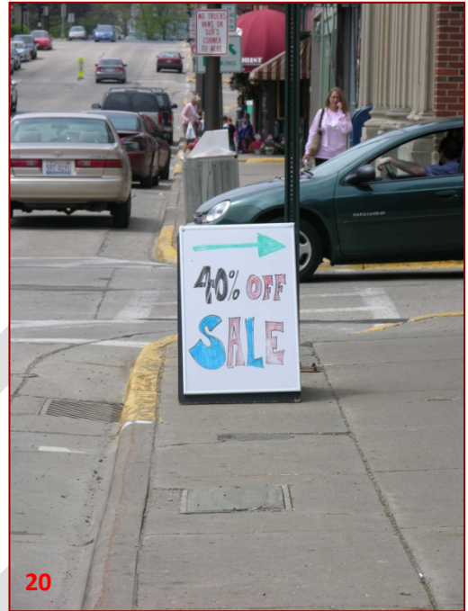
Does not meet the chalkboard/whiteboard size requirements.