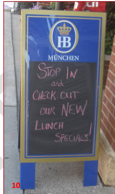
Wood sign, handwritten/business-related content, if compliant with chalkboard size requirements.