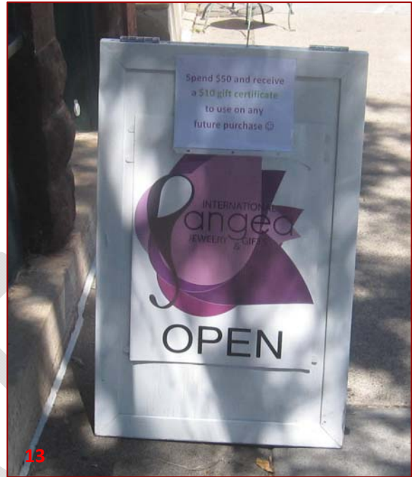
Graphics not painted.