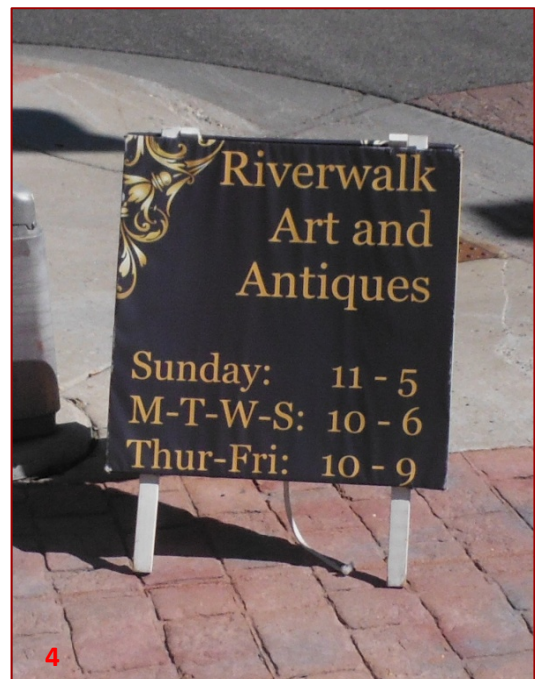
Wood sign, business-related colors.